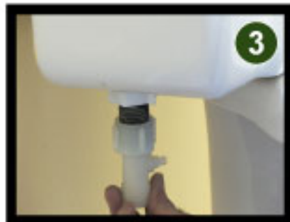
3 Install the "T" adaptor as shown