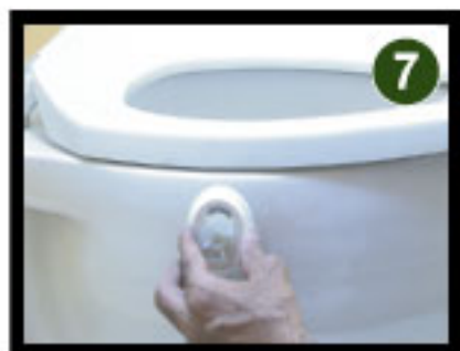
7 Place bottom part of the controller unit's suction cup and fully tighten the nut until fully secure on the toilet bowl