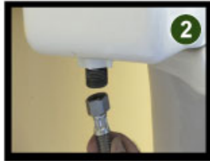
2 Remove existing flexible water pipe underneath the water tank