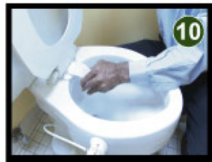
10 Install the Nozzle on the bowl under the seat (with the vacuum cups)