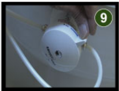
9 Snap on the top portion of the Controller on the base unit